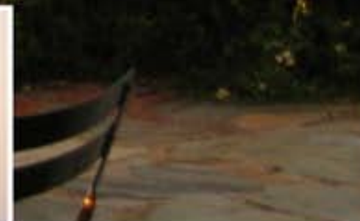
Top: Champagne with a view